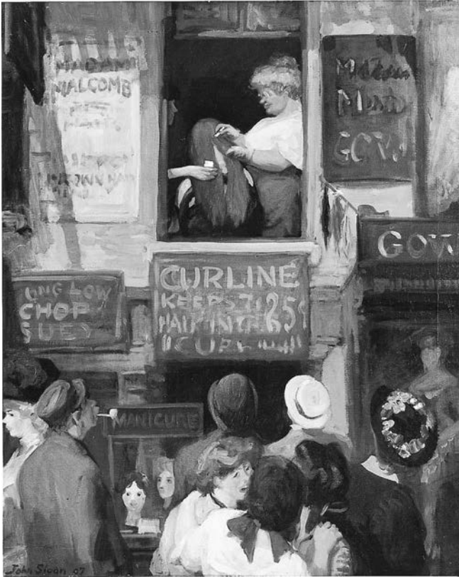
© 2011 Delaware Art Museum/Artists Rights Society (ARS), New York; Wadsworth Atheneum Museum of Art/Art Resource, NY